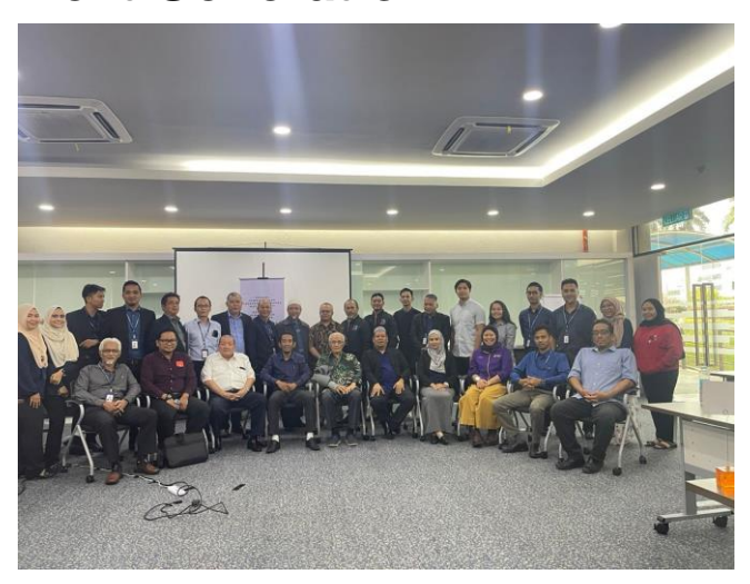
Next Gen Involvement in Aero Nusantara (ANSB) workshop for Urban Air Mobility ILSAS, TNB 12th September 2022

The Chairperson and vice chairperson of CILT Next Gen represented CILT Malaysia in a oneday workshop on Urban Air Mobility (UAM), including the new air freight and logistics areas using drones.