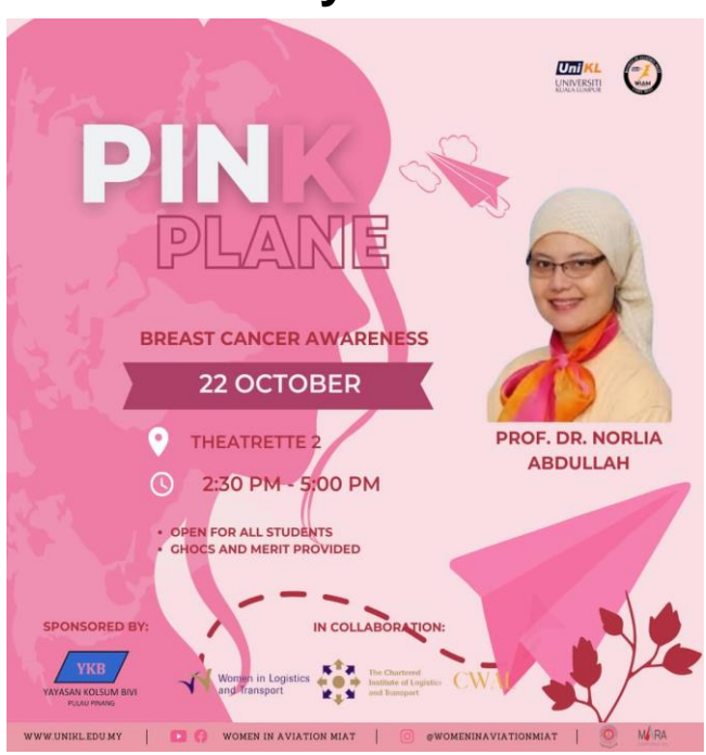
Pink Paper Plane Breast Cancer Awareness Program UNIKL MIAT, Subang Airport 22 October 2022

October is the month of Breast Cancer Awareness. Women in Logistics Transport (WiLAT) and the Centre of Women Advancement & Leadership (CWAL) were supporting the initiative from Women in Aviation MIAT.