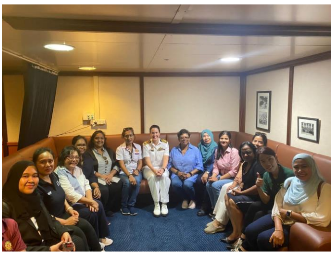
HMAS Adelaide vesseltour with WISTA Port Klang Cruise Terminal 12th November 2022

IBF Malaysia was invited under WISTA Malaysia ticket to join the tour of HMAS Adelaide organized by Royal Australian Navy during its stopover at Port Klang Cruise Terminal recently. HMAS Adelaide (L01), the second of two Canberra-class landing helicopter dock ships in the Royal Australian Navy.